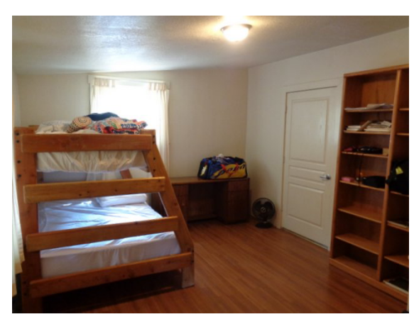
Bedroom with Bunk Beds