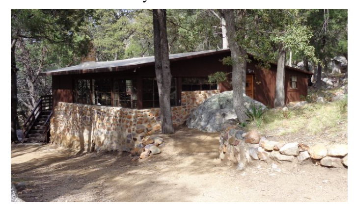
Kent Springs Center – March 2015

issues. They received $45,000 in donations for the renovation project and the work started in February, 1995. The building renovation also included electrical wiring, plumbing and a disposal area. The renovations were completed in the fall of 1995. Patsy Proctor had a dream of adding a deck to the house. She drew up the plans and $15,500 was spent to complete it. The interior furnishings (carpet, furniture, etc.) were provided as gifts by the Proctors and the Holisters who used to run the Santa Rita Lodge.