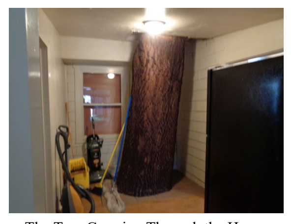
The Tree Growing Through the House