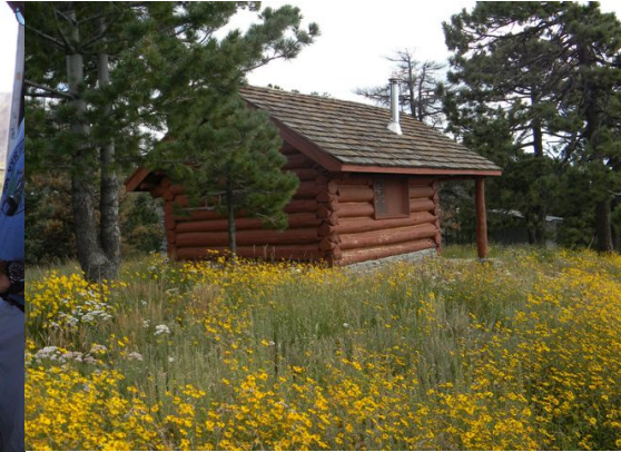
Fire Lookout Support Cabin Photo by Tom Johnson - 2012