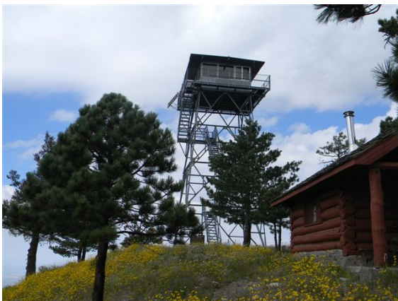
Monte Vista Fire Lookout & Support Cabin Photo by Tom Johnson - 2012

The Horseshoe II fire of 2011 ravaged a large portion of the Chiricahua Mountains and destroyed the Barfoot Lookout, another historic lookout, but fortunately did not affect the Monte Vista Lookout. The fire came close to the lookout site but bypassed it.