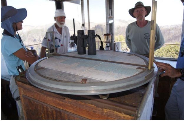
Ranger & Fire Finder Photo by Jim Chisholm - 2013