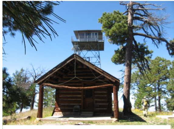
Monte Vista Fire Lookout & Support Cabin

The Monte Vista Fire Lookout has gone through three different iterations during its' life. It was originally constructed in 1916 as a "Crow's Nest" tower. This configuration was replaced in 1922 by a 30 foot Aermotor tower. Aermotor lookout towers were manufactured by the Aermotor Company of Chicago Illinois and since they were based on the design of Aermotor windmill towers, they had relatively small cabs (usually 7 ft. by 7 ft. with a fire locating device mounted in the center). This lookout was replaced in 1966 with a 14 ft. by 14 ft. USDA CL-100 metal cabin mounted on a forty-foot tall steel tower. The site also includes a support cabin and several outbuildings.