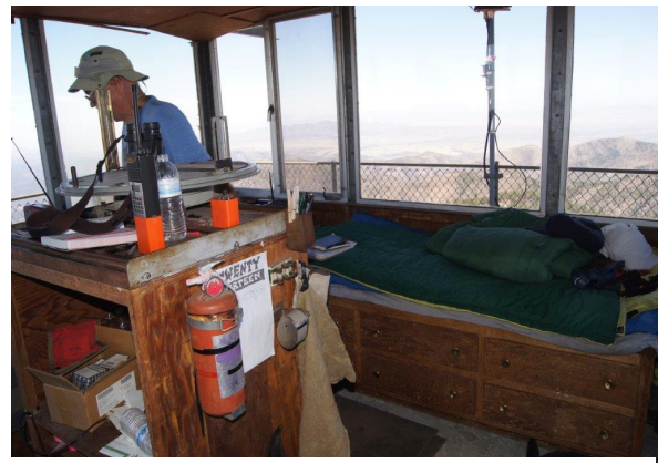
Ranger & Lookout Interior Photo by Jim Chisholm - 2013