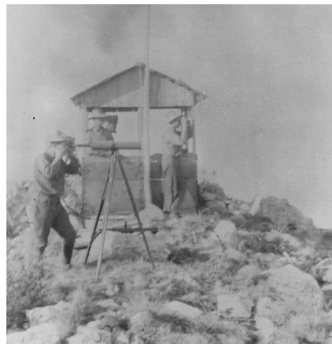
Old Baldy Fire Lookout about 1909

The first fire lookout was replaced about 1920 with a slightly larger structure. This lookout was also a relatively small, austere structure (approximately 8 feet by 8 feet). Like the first lookout, it also had neither windows nor doors to protect the Rangers from the elements. One feature that was carried over from the earlier lookout was the presence of telephone equipment that can be seen in the photo. The telephone line connecting the Madera Administrative Site to the lookout was completed in March of 1912. A 1917 National Forest map shows telephone lines also connecting the Madera Administrative Site to Patagonia and the Ranger Station in Rosemont